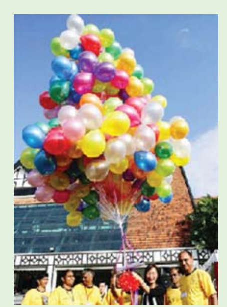
Kinrara assemblyman Teresa Kok MP (third from right) launching the event along with the organising committee and representatives of the RSC

In April, eight homes under the Ozanam Foundation umbrella were brought together for fun-filled day through the inaugural Royal Selangor Club (RSC) soccer charity carnival in Kuala Lumpur.