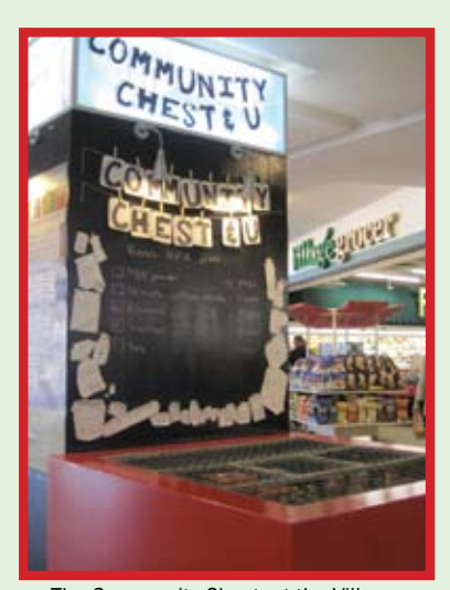
The Community Chest at the Village Grocer @ Bangsar Village

The ACE Group, an education based entity is a new partner which has come on board to collaborate with the Society in the area of education. The initial plan is for tutors from the Ace Group to provide free tuition to children in SSVP run Homes and three service centres — namely, OSC Sri Sentosa, Desa Coalfields and St Anne, Klang.